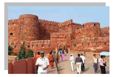
Overnight at the hotel.